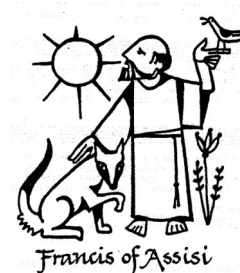
Francis of Assisi