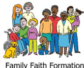
Family Faith Formation

For St. Philip families, especially those with children age birth – 5th grade. What will we do at Family Faith Formation?